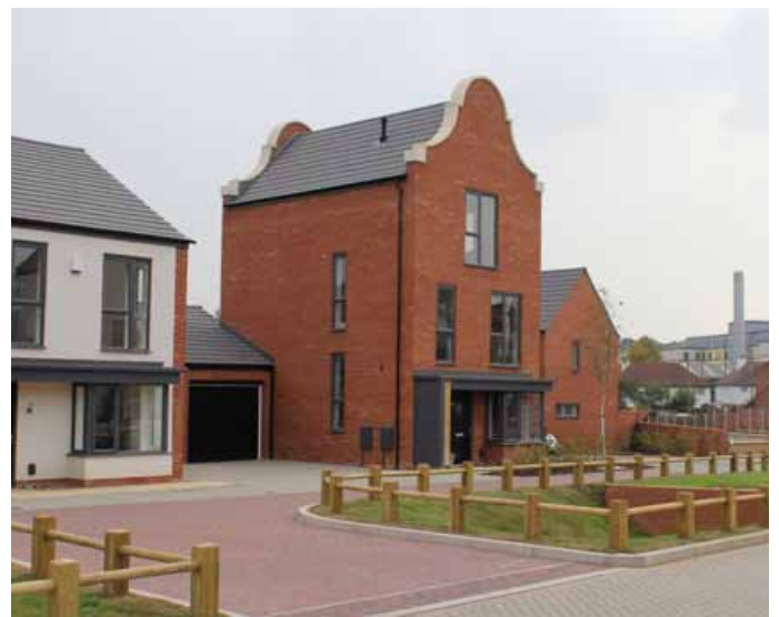
Marker buildings and spaces can help people create a 'mental map' of a place (Manor Kingsway, Derby)

Terminating views down streets with garages, the rear or side of buildings, parking spaces, boundary fences or walls.