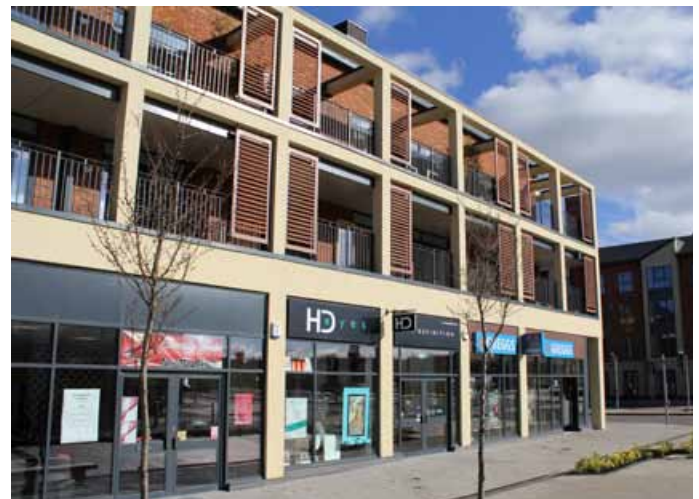
A mix of uses including homes, shops and other facilities in Lawley, Telford

Creating new places within a development where people can meet each other such as public spaces, community buildings, cafes and restaurants. Aim to get these delivered as early as possible. Think carefully about how spaces could be used and design them with flexibility