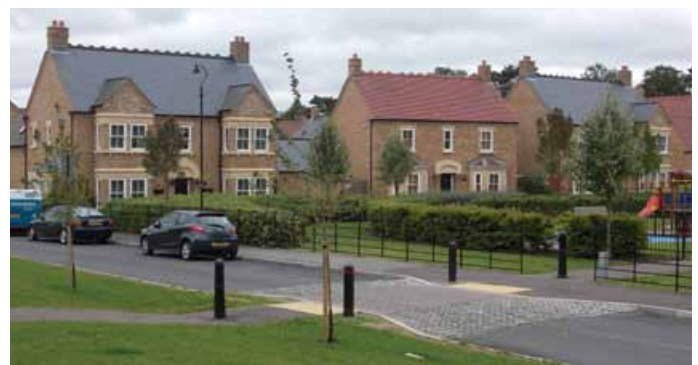
At Fairfield Park in Bedfordshire, vertical calming and 'pinch points' remind drivers they are in a 20mph zone

A pavement that has lots of variation in levels and dropped kerbs to enable cars to cross it can encourage unofficial parking up on the kerb and may make movement less easy for those pushing a pushchair, in a wheelchair or walking with a stick or walking frame.