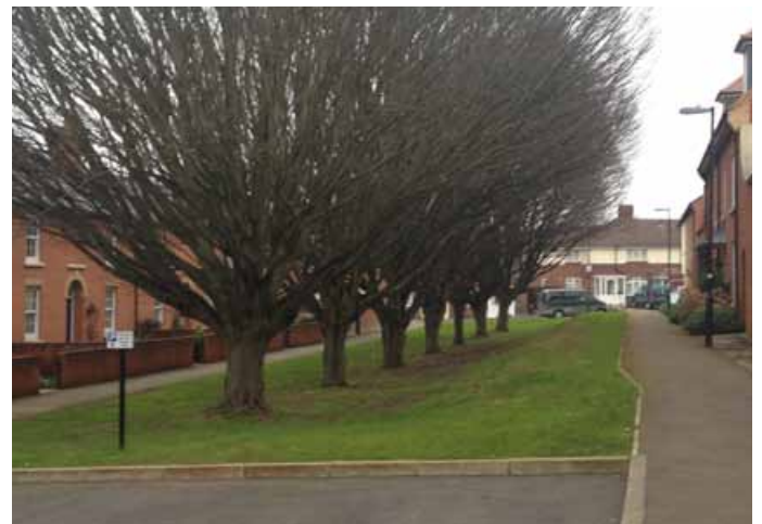
Existing mature trees on this site in Exeter add character and quality

Not carefully thinking about what balancing lagoons will look like and how people could enjoy them as attractive features within an open space network. Careful thought in the design process can eliminate the need for fenced off lagoons that are both unsightly and unwelcoming.